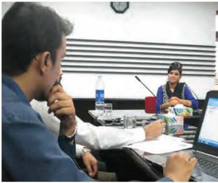
Meezan Bank held a Summer Internship Drive at DHA Suffa University campus.

A team of Meezan Bank's Human Resource Department conducted interviews of several BBA and MBA students who had shown interest in the Meezan Bank Summer Internship Program. The team received an overwhelming response from the students. Students greatly appreciated this opportunity to improve their exposure to the corporate world. Ten DSU students of Management Sciences will be part of Meezan Bank's Summer Internship Program 2015.